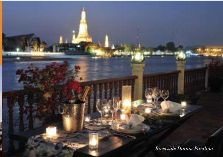
Riverside Dining Pavilion